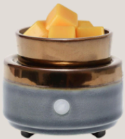
Melt Warmer $26