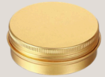
Bug Deterrent Lotion Candle $8

Lemongrass, Citronella + Eucalyptus Lemon