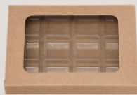
Lotion Melts $6