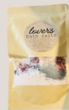
Bath Salts 1 pound: $35 15 ml glass tube: $2 20 ml glass tube: $4 4 oz bag: $6.75