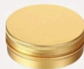
4 oz tin $8.50

Our luxury lotion candles are dual-purpose, hand-poured candles made from skin-safe oils and butters [shea, cocoa butter, soy + coconut oil] that melt into a warm, nourishing body oil offering both aromatherapy ambiance and luxurious hydration for soft, smooth skin when applied. Unlike traditional candles, our candles have a low melting point, making the warm liquid safe and soothing for skin, creating a spa-like experience perfect for massage + pedicures! Heart votives are bulk, one per customer. Lotion melts + warmers can be used in treatment rooms and sold in retail. 4 oz tins are retail products for your guests to take home the experience.