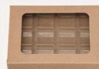
Lotion Melts $6