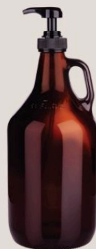
1 gallon $189

Our luxury massage oils are premium, skin-nourishing blends with high-quality carrier oils of organic fractured coconut oil + vitamin E with a signature blend of premium essential oils designed for superior glide, deep hydration, + aromatherapy benefits, featuring silky textures + non-greasy finishes. Our massage oils are organic, natural, free-from-synthetic-fragrance ingredients for an elevated, pampering experience. They go beyond simple lubrication to improve skin health + mood. Choose from our 40+ signature scents or have custom blends made for your spa at no extra charge along with free private labeling.