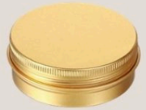
Bug Deterrent Lotion Candle $8

Lemongrass, Citronella + Eucalyptus Lemon