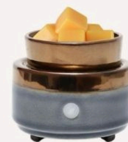
Melt Warmer $26/ MSRP: $42